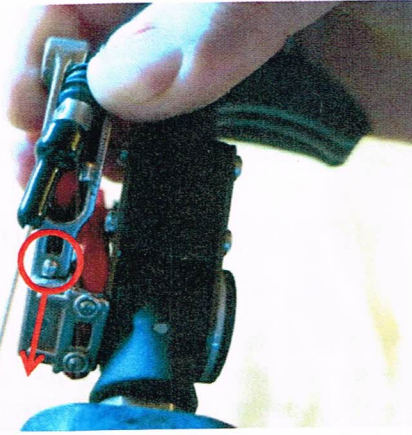
Figure 3: Push lever towards pivot to re-engage small bumps in lever slot and relock.

lever by pushing it back towards the pivot. The small bumps should re-seat in recesses on either side of the lever attachment slot, Figure 3 .